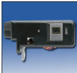
Optional Near End Sensor