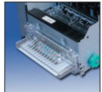
Optional Flashing LED Bezel