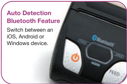
Auto Detection Bluetooth Feature

Switch between an iOS, Android or Windows device.