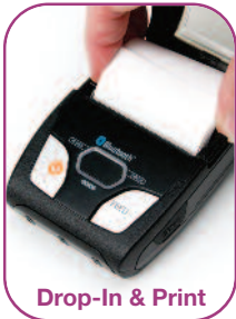
Drop-In & Print