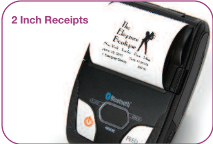
2 Inch Receipts