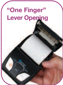
"One Finger" Lever Opening