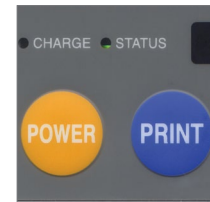
Large Operator Control Buttons