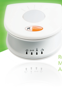
Ruckus MediaFlex 7811 Multimedia Wireless Access Point

802.11n Multimedia Smart Wi-Fi Access Point and Receiver