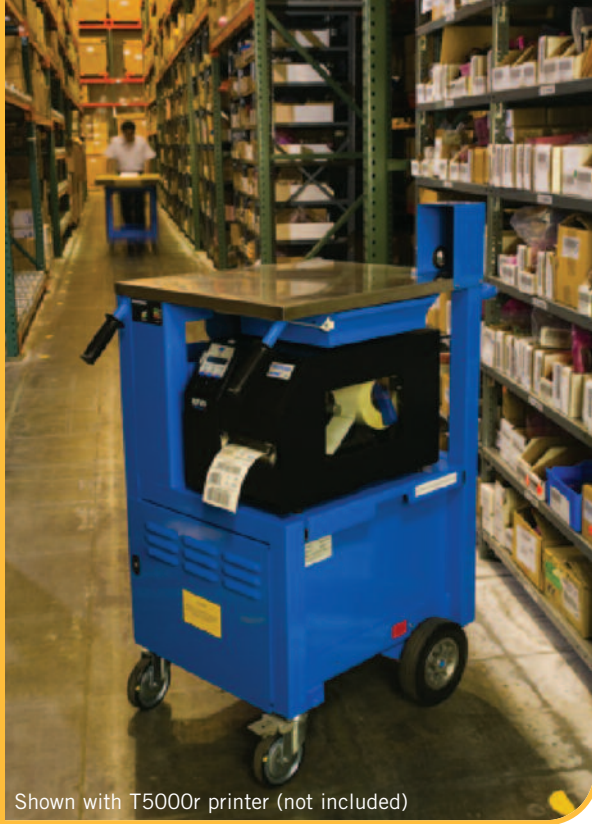
Shown with T5000r printer (not included)