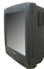
Wall / Pole mount