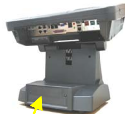
CD RW. Hard drive