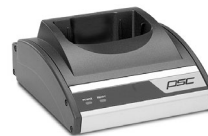
Falcon® Dock also available