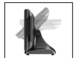
0° to 90° Tilt