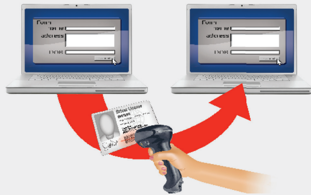
Automatically populate electronic forms in a single scan