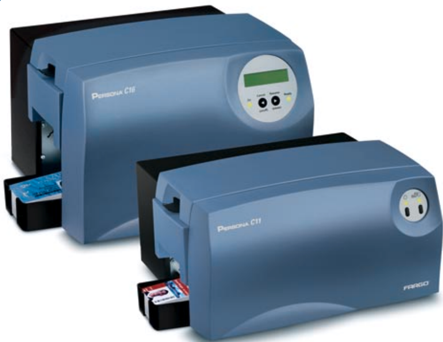
The Persona C16 and C11 Desktop Card Printers