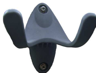
iSCAN100 Wall Mount Holster