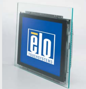
1547L ThruTouch monitor (overlay glass shown for illustrative purposes only)