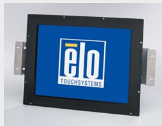
1547L DirectTouch monitor