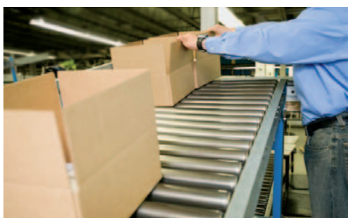
Order Fulfilment and verification