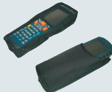
Functional and Protective Cases