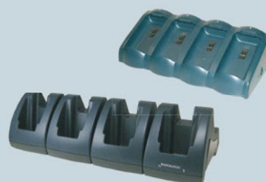
Single/Multiple Cradles/Kyman™ handle/ Multi-battery charger