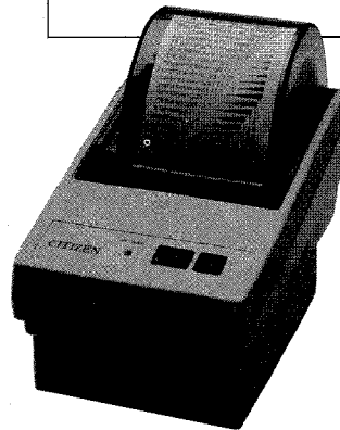
iDP-3110 With Optional BP-10 Battery Pack