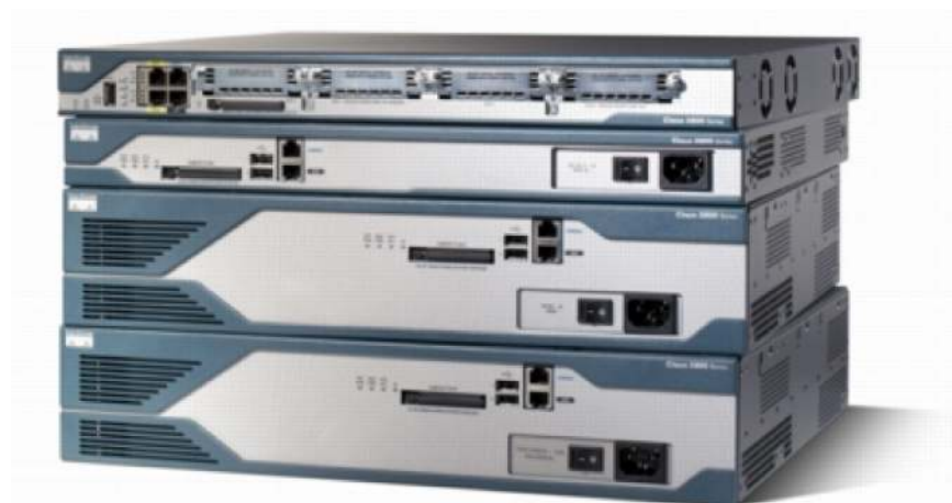
Figure 1. Cisco 2800 Series

Cisco Systems ® , Inc. is redefining best-in-class enterprise and small- to- midsize business routing with a new line of integrated services routers that are optimized for the secure, wire-speed delivery of concurrent data, voice, video, and wireless services. Founded on 20 years of leadership and innovation, the Cisco ® 2800 Series of integrated services routers (refer to Figure 1) intelligently embed data, security, voice, and wireless services into a single, resilient system for fast, scalable delivery of mission-critical business applications. The unique integrated systems architecture of the Cisco 2800 Series delivers maximum business agility and investment protection.