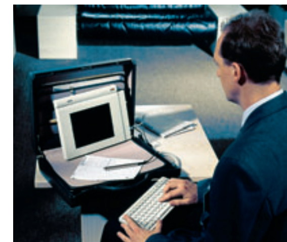
External keyboard for pen-based computer.