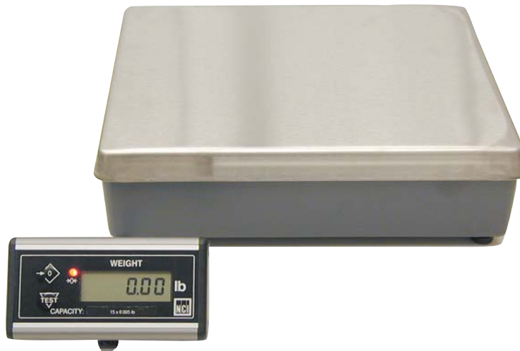
NCI Model 7820R shown with standard flat shroud