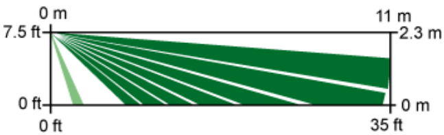
Side View Broad: 11 m x 11 m (35 ft x 35 ft)