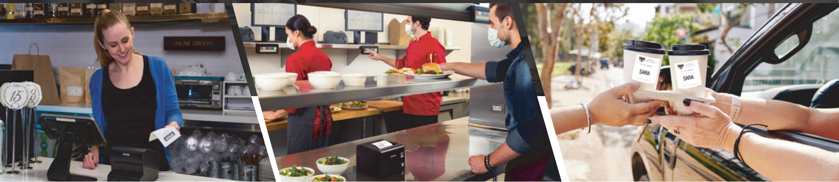
Print Receipts at Pickup Station

Revolutionizing the world of online ordering, Epson offers a wide range of printers to help restaurants efficiently process customer orders. Our solutions can help users accurately identify orders, eliminate waste caused by errors, and expedite order fulfillment. See how it works for this restaurant!