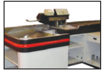
Scan, bag & chute-checkout