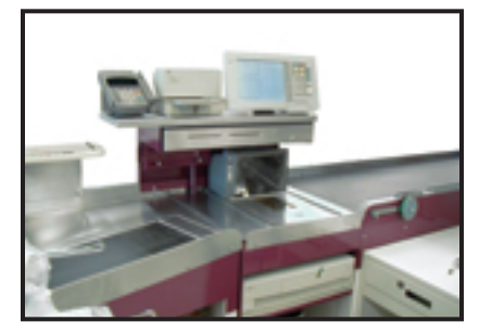
Belted take away lane